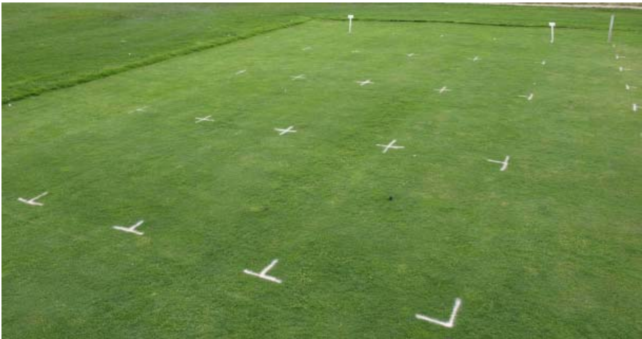
Figure 1. Plot area September 4, 2008.